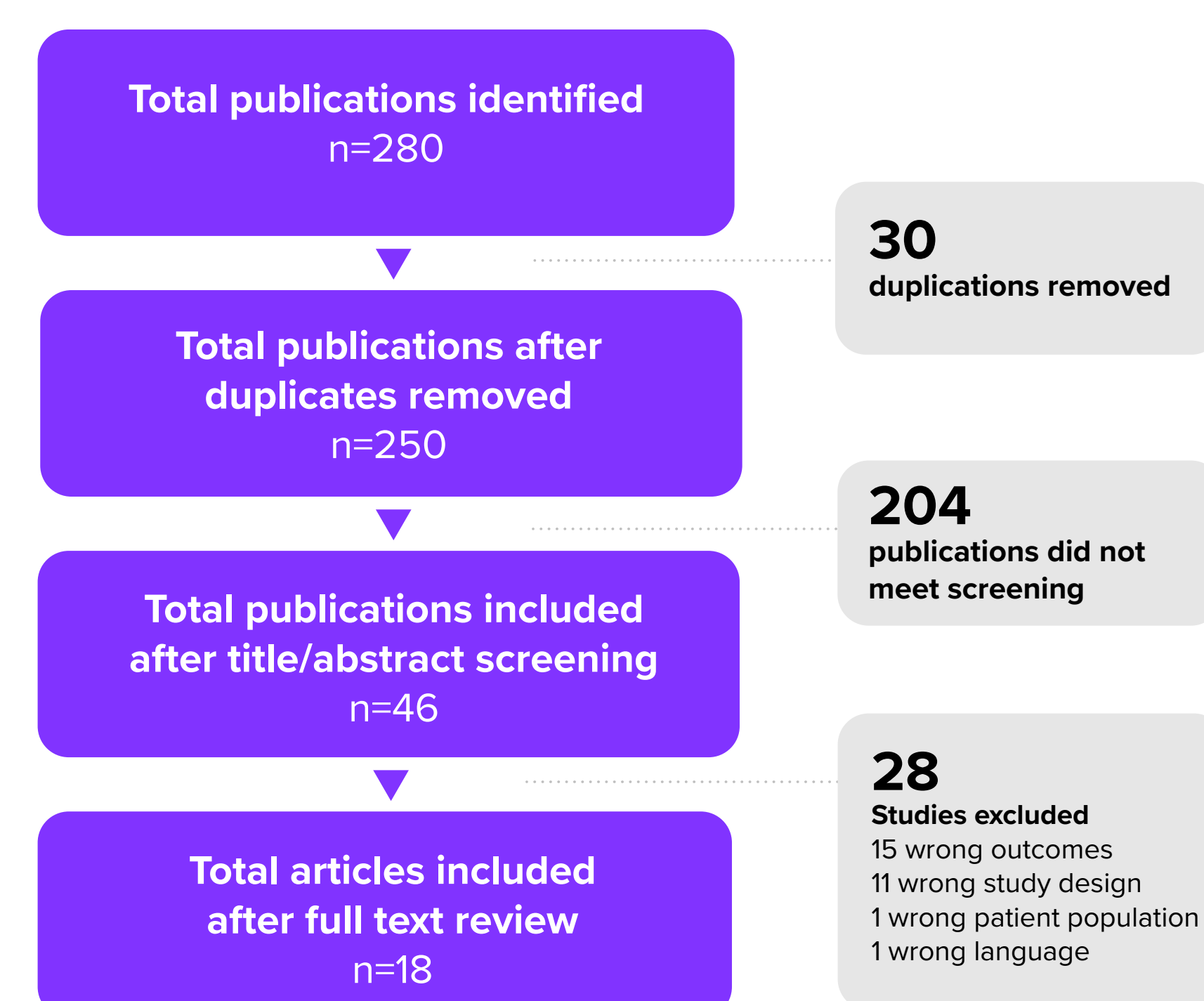
Figure 1: PRISMA diagram